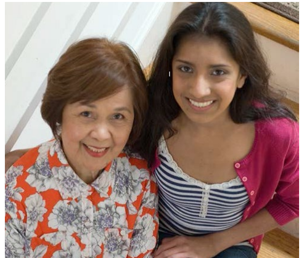
Home Sharing Participants in San Mateo County