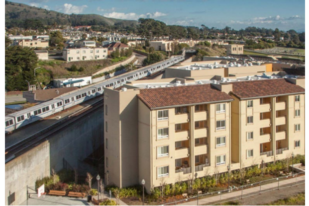
Housing near transportation in Northern San Mateo County